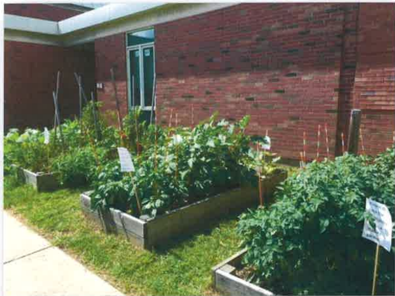
TEMS Student Garden

As always, we are here to answer any questions or concerns you may have.